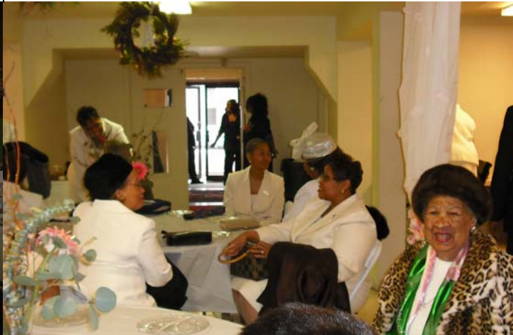
Sorors gather before the start of the Founders' Day 2009 worship service at the New Bethlehem Baptist Church in Baltimore