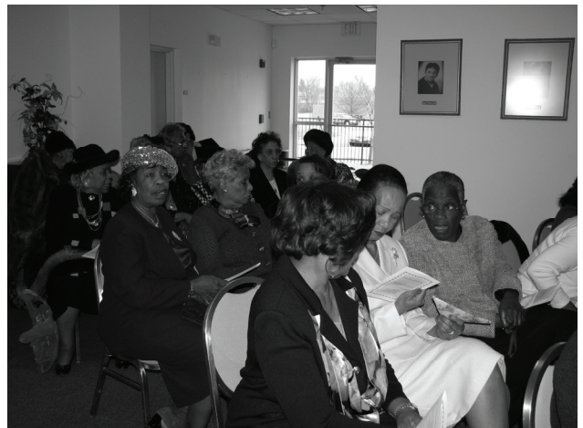
Sorors listen intently at the reception as committee members introduce the honorees and discuss the program.

On January 18, 2009, the Foundation and Chapter hosted a reception to present the seven honorees and reveal program details, which include workshops on financial management, time management and self-esteem. The workshops are designed to prepare the honorees for their transition from high school to college.