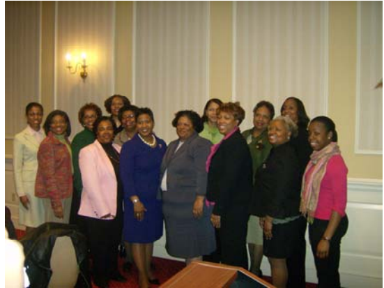
Basilei from 16 Maryland Graduate Chapters gather for a group photo