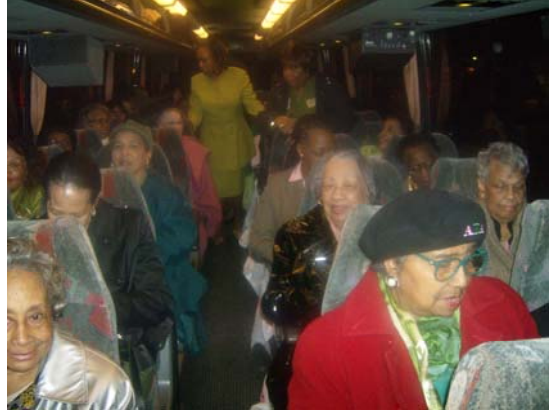
On the Road to Annapolis—Sorors prepare for the journey to Annapolis

For those sorors who were not able to join us, you missed a truly enjoyable, informative and enlightening experience. Now that we have brightened the halls of the Senate Office Building in Annapolis with our pink and green, it is now time to visit the City Council Chamber of Baltimore City. AKA Night at City Hall will be on Monday, May 18, 5 p.m. Sorors are encouraged to wear pink or green. More information will be shared at future Chapter meetings.