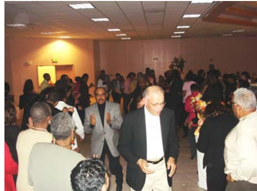
Attendees boogie down the Soul Train Line