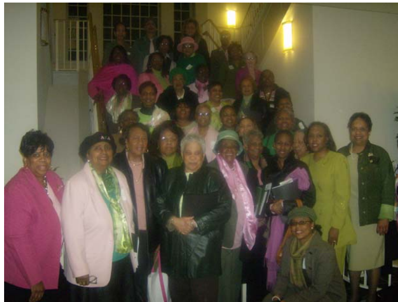
Forty-two Sorors journeyed to Annapolis to learn about policies concerning health care and energy and to hear from our fellow Sorors who represent us in the Maryland General Assembly

Epsilon Omega Joins Other Chapters in State's Capital to Learn about Policies that will Shape Our Future