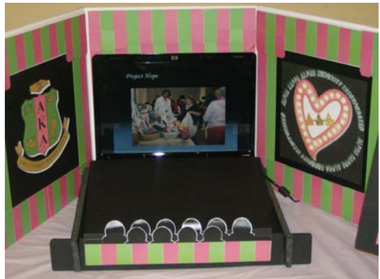
Connections Committee display designed by Soror Joann